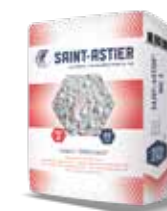
TÉRÉCHAUX® NHL2 - 25 KG