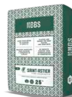
MBBS® - 25 KG Ready-to-use bedding mortar for bio-based blocks (hemp, flax, rapeseed...)

For application, consult our technical documentation on lime & hemp