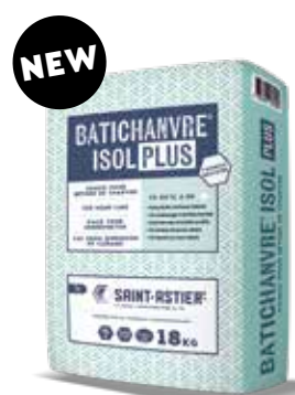
BATICHANVRE® ISOL PLUS 18 KG The most insulating