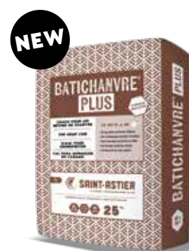
BATICHANVRE® PLUS 25 KG The classic