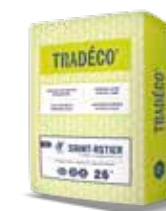
TRADÉCO® 25 KG