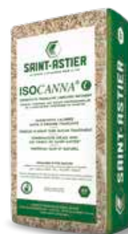
ISOCANNA® - 20 KG French hemp shives labelled « Building Hemp »